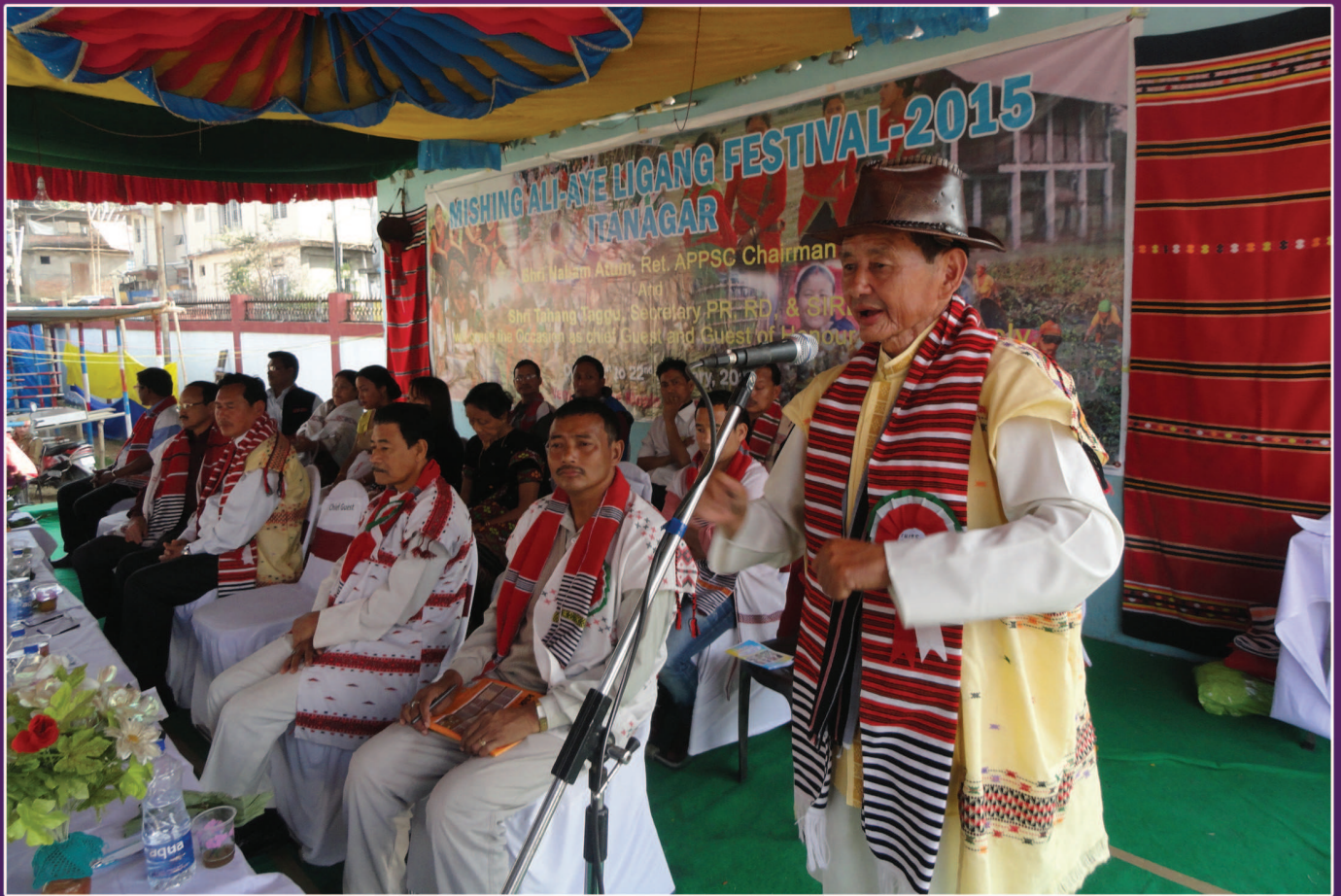
Ali-Aye Ligang, the main and only festival of Mising tribe, celebrated by the people of the community living in Itanagar