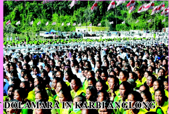
RELIGIOUS-SOLIDARITY MEET AT DOLAMARA IN KARBI ANGLONG