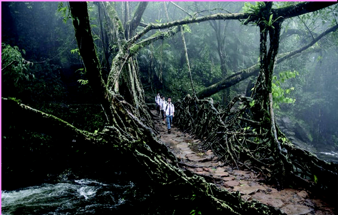
Living Root Bridges of Meghalaya